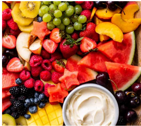
Fruit Platter (v) seasonal fruit