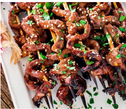
Beef Satay Platter teriyaki glaze, toasted sesame

Elevate your event with unique stations and options that will be sure to wow your guests. Food stations and add-on options can be customized. Please speak to our Events Team to see how we can add that extra touch to make your event truly special!