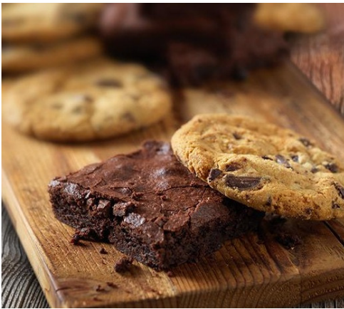
Dessert Platter (v) chocolate chip cookies, pecan caramel brownies

All platters serve approximately 8 to 10 persons, unless otherwise noted.