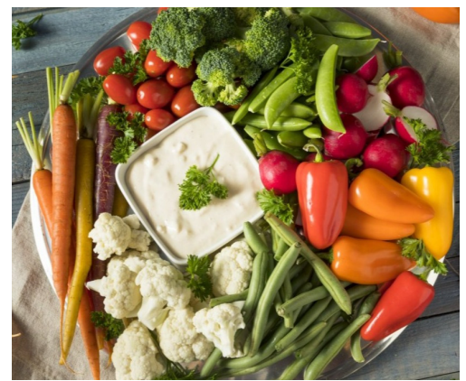
Crudites Platter (v) assorted raw veggies + dip