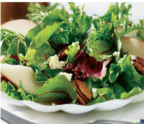
Salad Platter (v) field greens salad