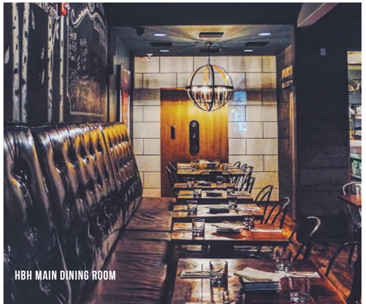
HBH MAIN DINING ROOM