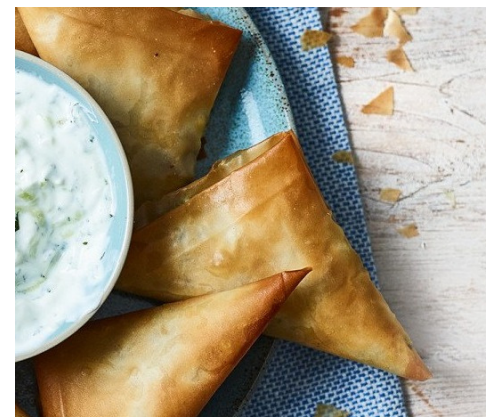
Veggie Samosa Platter (v) mint and cucumber raita