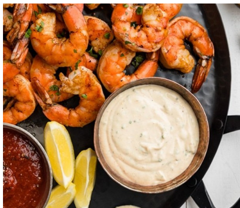
Shrimp Cocktail cocktail sauce